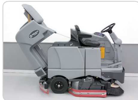
No tools are needed to lift off recovery tank for extra access to batteries and squeegee assembly.