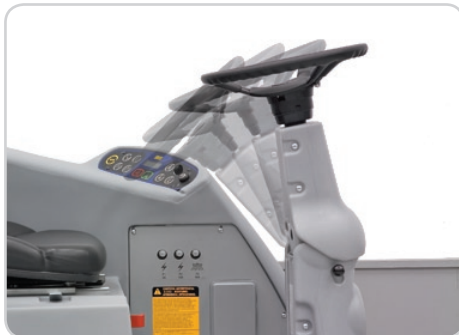
Ergonomic command compartment with tilt steering allows for easy ingress and egress.