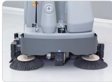
Retractable side brooms on cylindrical models sweep debris away from pallets and walls.