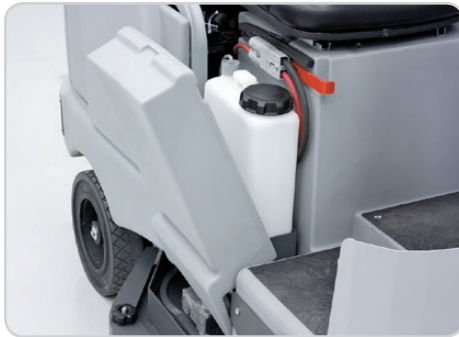
Condor™ AXP models have easily accessible detergent cartridges