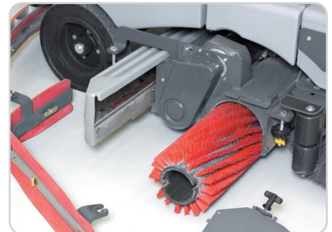
A large, non-corrosive hopper on cylindrical models allows for maximum debris capacity without overflow and slides out for easy debris disposal.