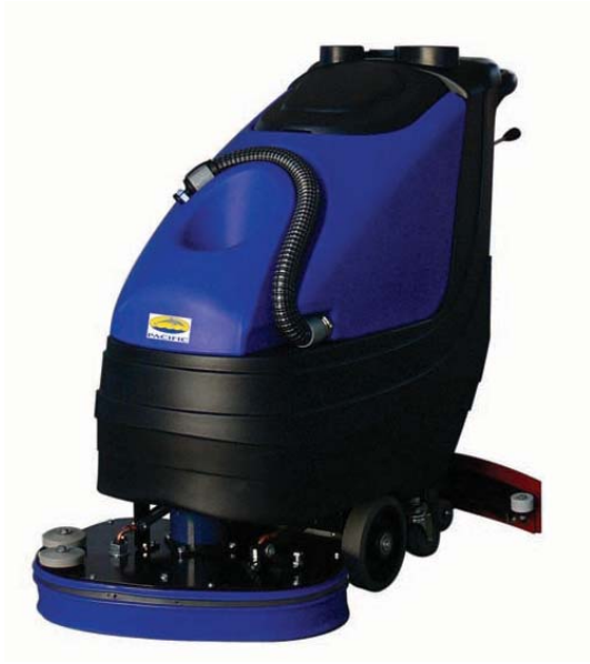
Z210 and Z210E