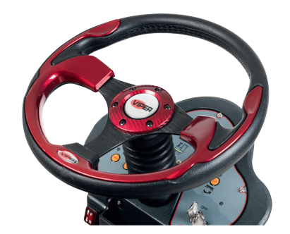
Intuitive dashboard, with single touch buttons for simplicity and ease of use