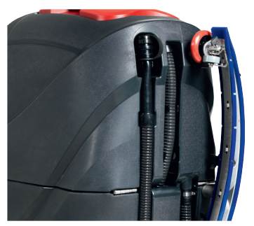
Built in squeegee hanging system for ease of transport in narrow areas