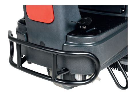
Standard front bumper protects the machine