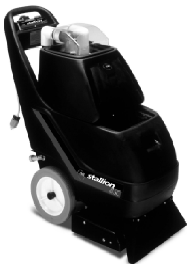
8-Gallon Self-Contained Carpet Extractor

The Stallion 8SC features speed, maneuverability and deepdown cleaning, making it the perfect extractor for every carpet application. In fact, the Stallion 8SC is twice as fast as tub extractors, covering 1,400 square feet an hour.