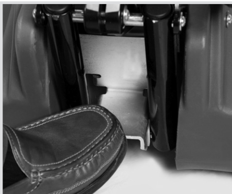
Easy-to-operate pedal releases the control handle to the operate or storage position.

The Ultra Speed Series is ultra quiet for noise sensitive areas.