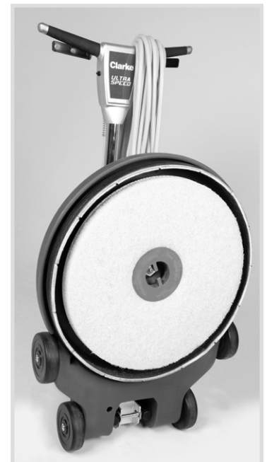
The upright storage position allows for easy pad change.