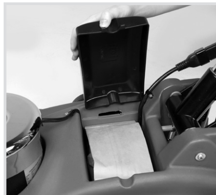
Passive dust control eliminates airborne dust and collects it in a convenient filter bag.