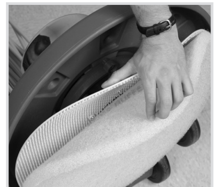
Flexible pad driver with full face pad grip contours to uneven floors.