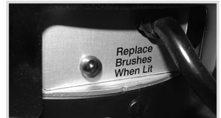
Motor carbon brush wear indicator light alerts the operator to protect the motor.