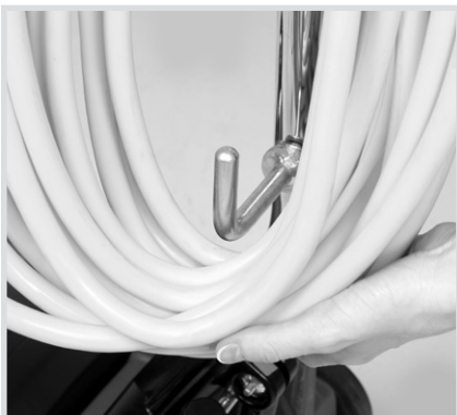
A quick release cord wrap assists the removal of the power cable without unwrapping.