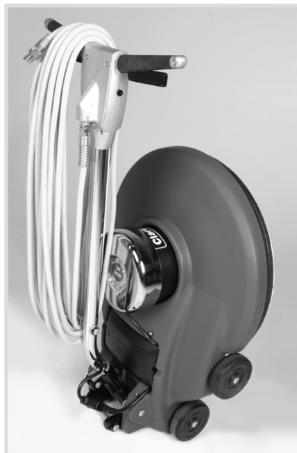
The folding handle permits the burnisher to fit into storage spaces.