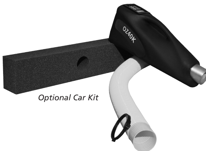
Optional Car Kit