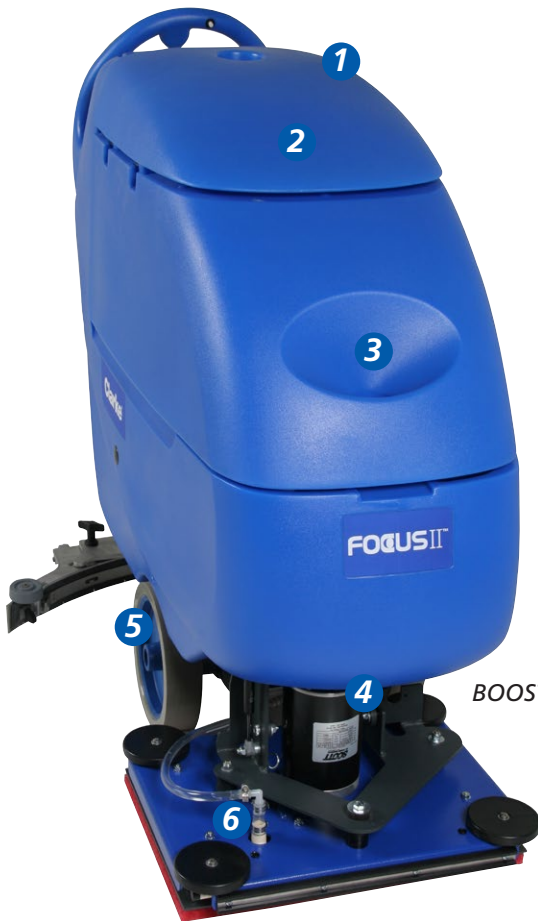
BOOST® L20 Shown