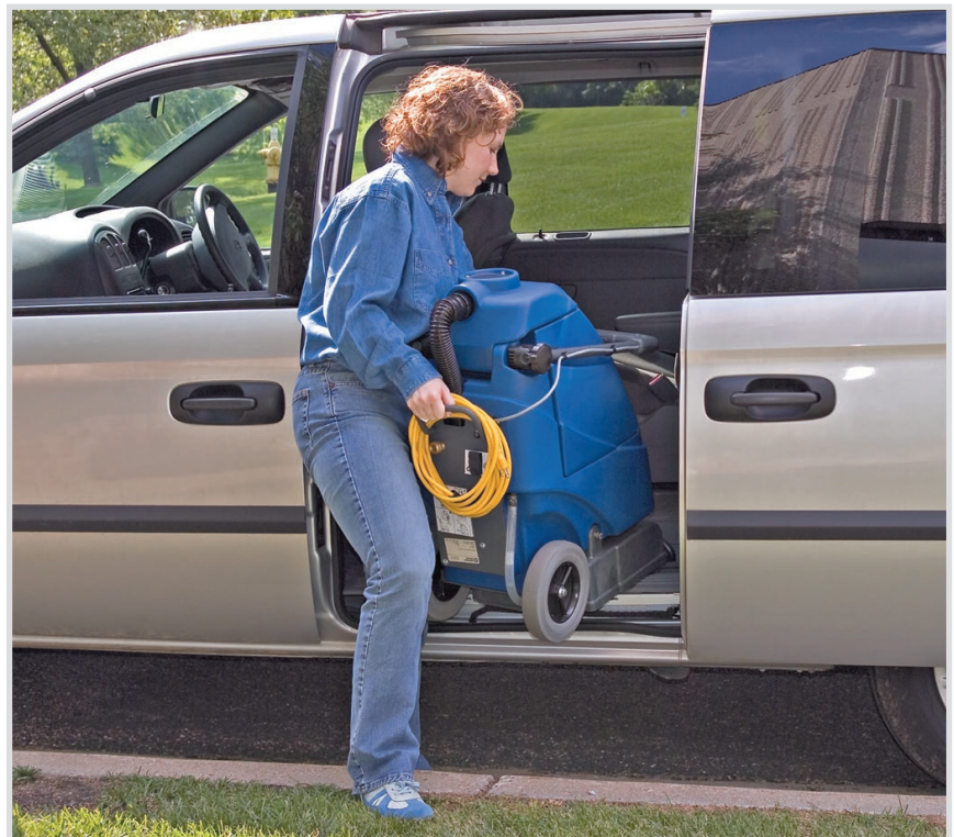
Hand grips and compact folding simplify easy lifting and transport.