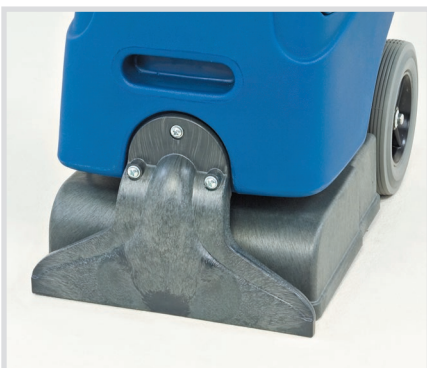
The vacuum shoe is designed with laminar flow technology allowing more moisture recovery, resulting in fast drying times.