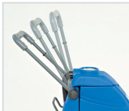
Fold down handle for easy storage and transportation.