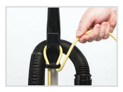
Cord restraint protects against cord abuse.