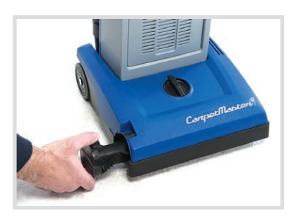
Tools-free access to remove brush.