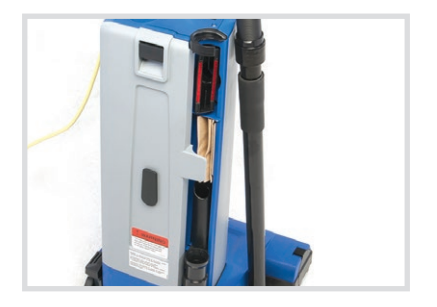
Accessories are conveniently tucked behind the vacuum wand.