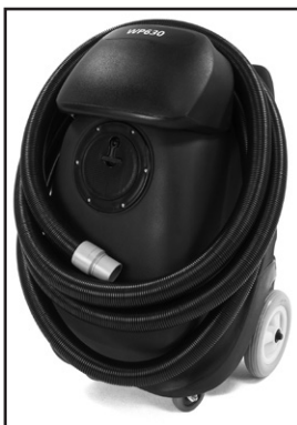
50 foot long hose for convenience.