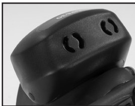
Top mounted, dual three-stage vacuums increase airflow efficiency and vacuum performance – improving water recovery.