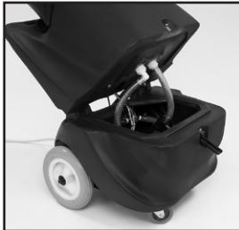
Clamshell design for easy servicing.