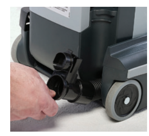
Easy access to clogs, minimizing potential downtime