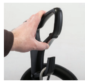
Innovative quick cord clip for simple cord management