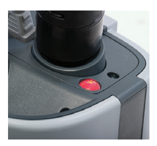
Indicator light shows when bag is full or vacuum is clogged