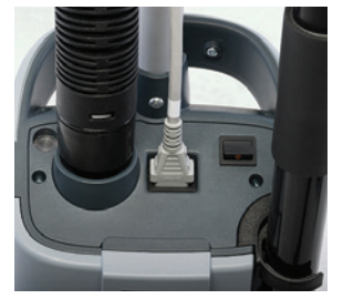
Detachable power cable for quick service