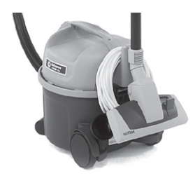
The unique parking solution means that the VP300 can be easily stored or transported, even when space is limited.