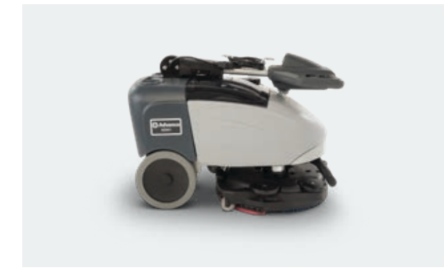
Easy to transport and store with limited space, thanks to the compact design and fold-able handle