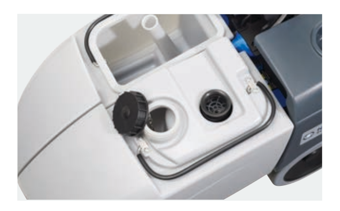
Comfortably and conveniently fill and empty the SC351 with the removable two tank system and rubber protected handles