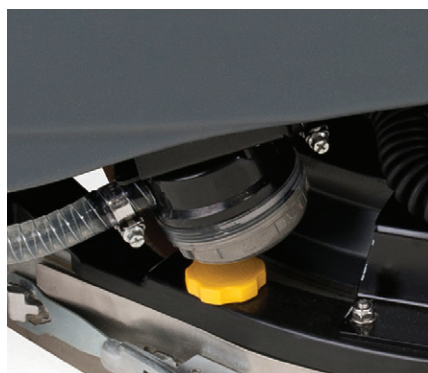
Externally mounted solution filter allows operators to easily clean the filter and manage the solution level.