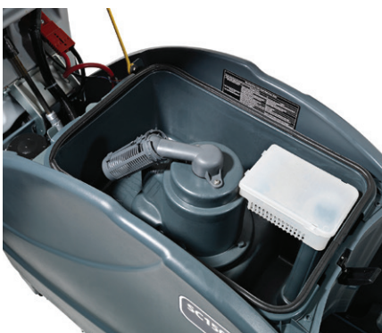
Flip-up lid and tilt-back tank provides easy access to the recovery tank, debris catch cage, batteries and EcoFlex™ cartridge.

Warehousing Assembly Plants Athletic Facilities Dry Food Processing Airports and Hangers Clean Manufacturing Smooth Floors