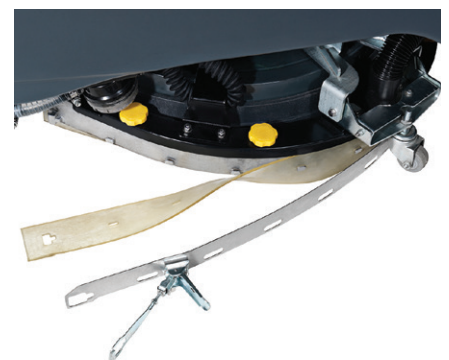
Squeegee wraps around the deck for 100% water pick-up and simply clips onto the bracket with no thumb nuts or adjustment required.