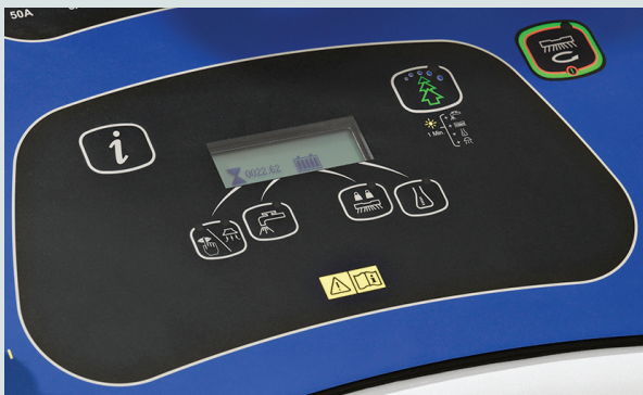
Simple, intuitive controls minimize operator training.

Clean green and still meet the highest expectations for clean floors with the standard onboard EcoFlex System™. The EcoFlex System controls the consumption of detergent so effectively that real savings can be gained without compromising performance. With a single button, effortlessly switch between chemical-free cleaning or select from weak to strong cleaning intensities to match cleaning performance to the soil on the floor and the required level of clean. More soil? No problem. Activate the "burst of power" for extra cleaning performance and easily return to the original settings for minimum usage of water, detergent and power.