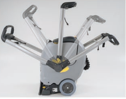
An adjustable handle allows for easy maneuverability, decreasing the need for backing into tight spaces. (ES400<sup>™</sup> XLP shown)

The front-mounted drain hose 1 allows for faster and easier dumping for the operator Integrated hand tool offers guick access 2 and eliminates the need for replacement parts (standard on XP and XLP models) A floating brush head needs no 3 adjusting, creating better carpet contact and improved water recovery The removable tank with stowable 4 handle makes the re-filling process far less cumbersome All cleaning modes are mounted 5 on the panel for quick engagement and easy operation A larger tank with increased 6 water capacity provides extended cleaning time and fewer refills 6 Advance New handle design means improved maneuverability in tight spaces Schools Small Businesses Healthcare Facilities Retailers Offices