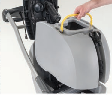
The removable, increased capacity tank along with the stowable handle make refilling much simpler.

Simply flip a switch to easily shift from spotting to extraction mode.