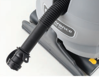
The front-mounted nozzle makes dumping much faster and easier for the operator.