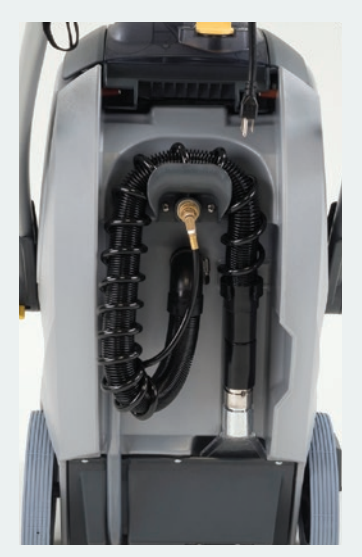
Integrated hand tool (standard on XP and XLP models)