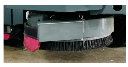
Widen the cleaning path from 40 up to 56 inches / 1,020 to 1,420 mm

Ideal for more porous concrete, ES filters and recycles recovered solution, dramatically extending cleaning time.