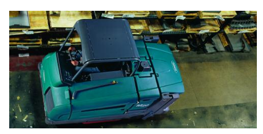
Protect the operator and machine Ensure safety in severe environments with an overhead guard.