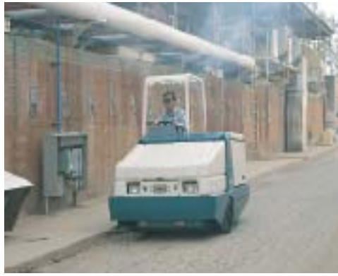
Picks up even the rocky debris found in brick-yards and cement plants.