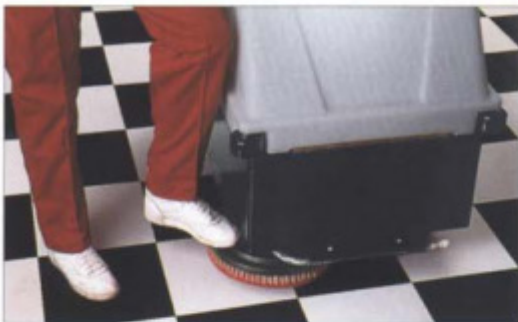
Snap on/snap off brushes can be changed in seconds