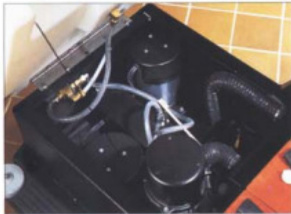
Convenient access to moisture protected components and batteries