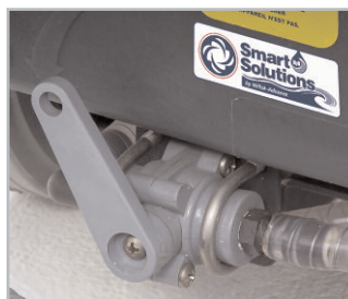
Variable solution flow with Smart Solutions™ for productivity and safety