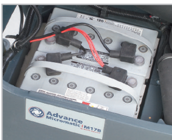
Maintenance-free gel batteries with onboard charger come standard on machine (M17B)