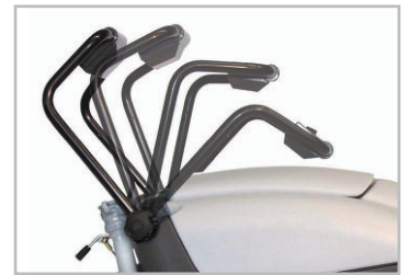
Adjustable ergonomic handle system provides comfort for all operators. Wrap-around design also allows for multiple hand positions to reduce fatigue and repetitive stress injuries. Handle folds down for storage