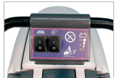
Simple and intuitive operator controls to minimize training