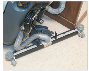
"Break-away" rear squeegee prevents damage to machine and facility