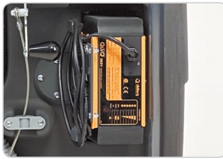
Warrior^ AXP^{\rm TM} scrubber includes a standard onboard battery charger for wet or gel battery packages.