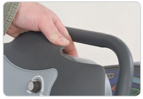
Soft-Touch<sup>™</sup> Paddle System prevents finger pinching, provides maximum control, reduces repetitive-stress injuries, and prevents the operator from being pinned between the machine and an obstruction.