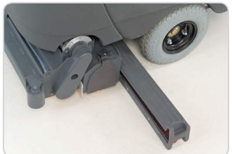
Cylindrical scrub decks sweep and scrub in a single pass with dual counter-rotating brushes. Polyethylene hopper eliminates corrosion.