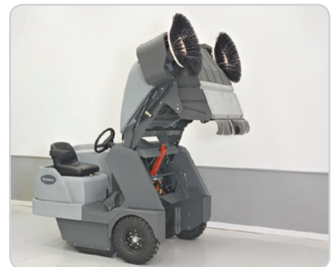
For optimal safety, the operator controls the hopper safety arm from the seat. The sweeping systems automatically shut down when the machine stops.