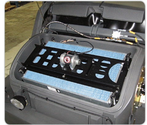
Ultra-Web® dust filter is >98% efficient on 0.3 - 1 micron dust. This meets MERV 13 on the ASHRAE 20 point scale.