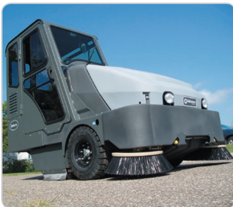
The optional all weather cab keeps the operator comfortable and productive. Clear-View™ window in the cab provides a safe view of the right side broom.