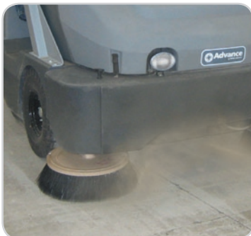
DustGuard™ suppresses airborne fugitive dust allowing continuous use, and increasing productivity by up to 71%.