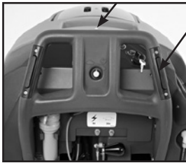
Easy to use palm switches on durable handle