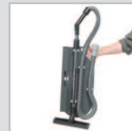
Onboard Scrub-Vac System