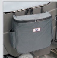
Onboard Tote Bag