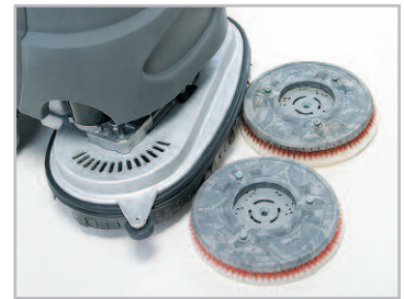
Click-off disc scrub heads for productivity and convenience.