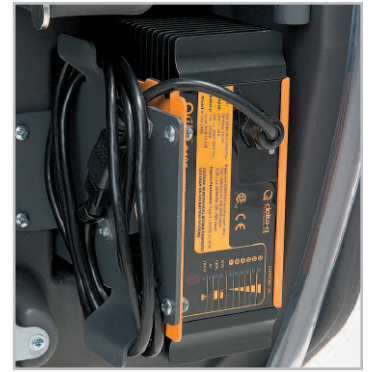
Standard onboard battery charger for wet or gel battery packages.