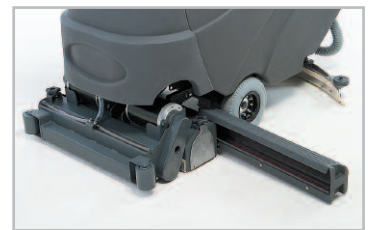
Cylindrical scrub decks sweep and scrub in a single pass with dual counter-rotating brushes. Polyethylene hopper eliminates corrosion.