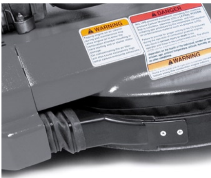
The Dust Control series offers a unique floating shroud that directs the high velocity airflow near the floor to collect six times as much dust as competitive models.