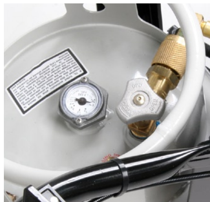
Large 20 pound 80% safety fill propane tanks offer long working time between refills and also prevents overfilling.