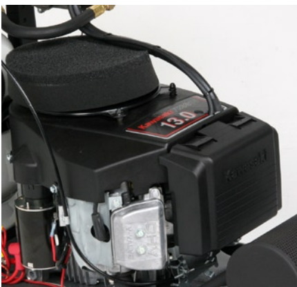
All models have Kawasaki Twin-V engines that provide maximum power.