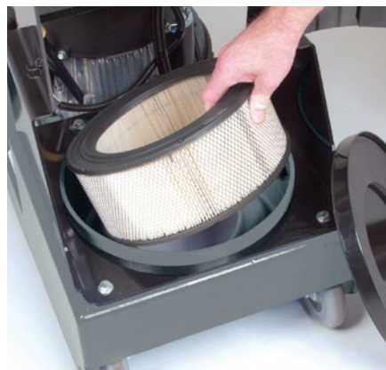
Automotive style air filter for improved indoor air quality. Dust Control system extends pad life by preventing particle build-up in the pad.