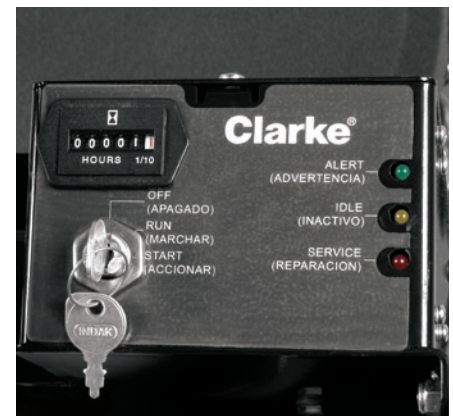
Control panel lights inform operator of emissions controls and engine performance. Planned maintenance intervals are easily monitored with the onboard hour meter, and the standard key-ignition switch prevents unauthorized use.