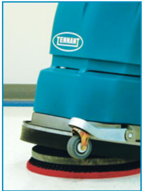
The Speedlock™ feature on the 5100 makes changing brushes or pad drivers as easy as touching a button.