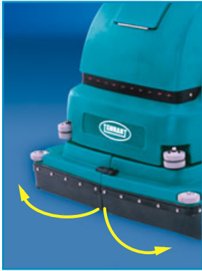
The swing out split skirt system on Models 5500-5560 allow for quick and easy brush/pad changes.