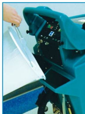
The 5100 is equipped with a convenient rear fill port that allows the operator to fill with a bucket or hose.

Tennant's automatic floor scrubber line offers a full range of walk-behind models, with variable scrub path widths, optional recycling systems and off-aisle cleaning, we're sure to have the right scrubber for your job. All of our scrubbers feature simple controls and easy-to-read gauges so that operators do a perfect job the first time. Built to last, our scrubbers are constructed of durable rotationally molded polyethylene to withstand daily wear and tear. Most importantly, Tennant scrubbers leave your hard floors clean and attractive, dry and safe.